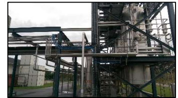
Pictures of pressure testing with air (allowed within the ASME world, Cooling Central on LNG gaster which was after GL-rulesets. Below pictures of heating central and ethanol distillation plant.