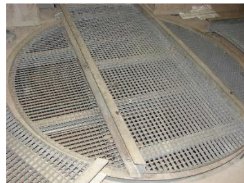
Unloading of tanks onto a special trolley